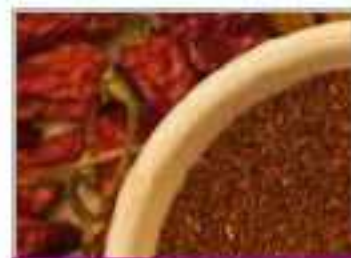
CHIPOTLE & ANCHO CHILI PEPPER