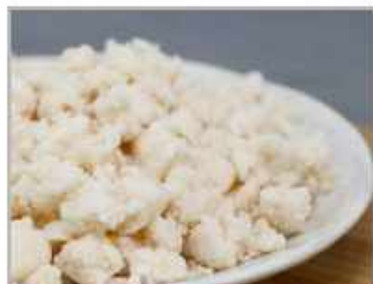
OKARA-SOY BEAN PULP