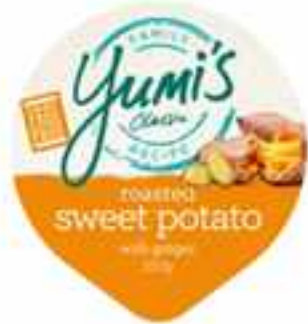
Yumi's Sweet Potato & Fresh Ginger Classic Dip, Australia