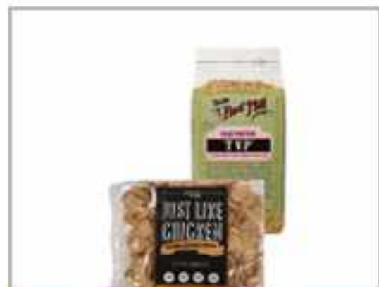
TVP- TEXTURED VEGETABLE PROTEIN