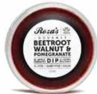
Roza's Beetroot, Walnut and Pomegranate Dip, Australia