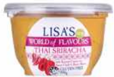
Lisa's World of Flavours Thai Sriracha with Roasted Capsicum, Sweet Chilli & Butter Beans, New Zealand