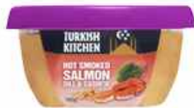
Turkish Kitchen Hot Smoked Salmon Dill & Cashew Dip, New Zealand

// The breadth and diversity of dip innovations in Australia and New Zealand could act as a pointer to future global flavour trends. //